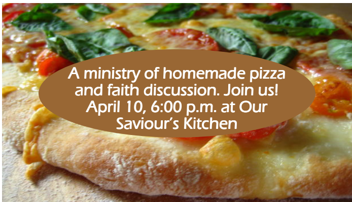
A ministry of homemade pizza and faith discussion. Join us! April 10, 6:00 p.m. at Our Saviour's Kitchen