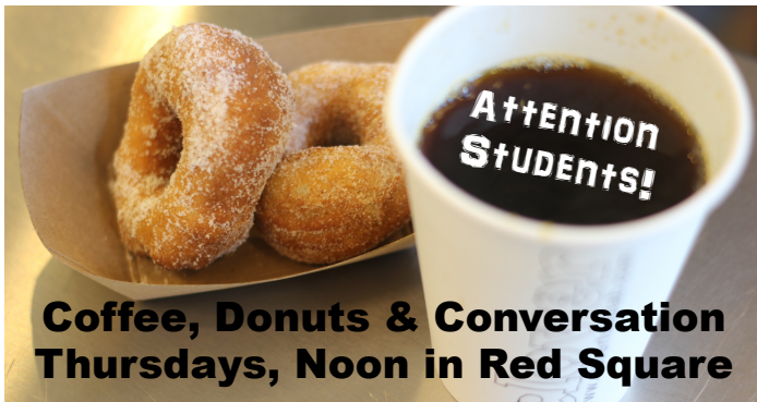
Coffee, Donuts & Conversation Thursdays, Noon in Red Square